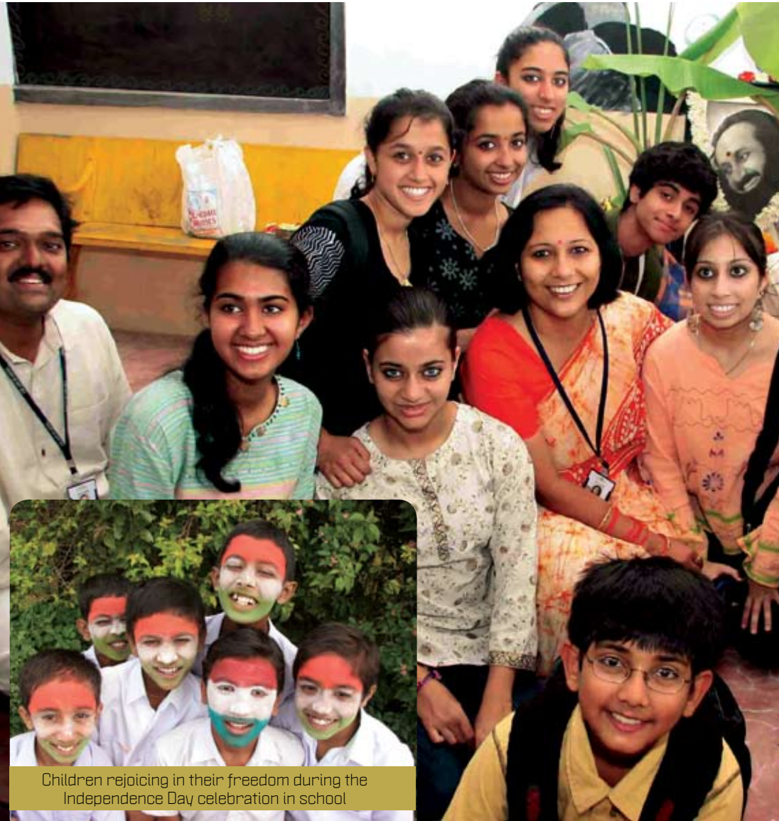
Children rejoicing in their freedom during the Independence Day celebration in school