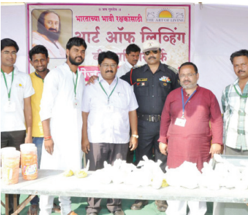
Feeding patriotism: Volunteers preparing and supplying food to Army aspirants

600-800 applicants visited the campus every day from different parts of the state, especially from Pune, Beed, Nagar, Usmanabaad and Latur. The breakfast included biscuits, bananas and poha, and lunch comprised roti, rice, dal and vegetables. Mineral water was also provided, said AoL teacher Sharad Dolkar. The food was prepared in Ramnagar un-