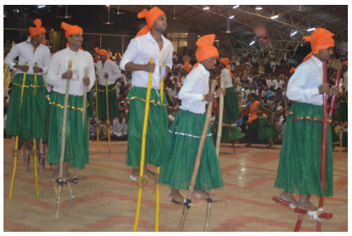
Dance on stilts: Gedhi dance at Bangalore ashram

Traditionally, the state is famous for kabaddi, and almost everyone plays it. To capture the spirit and energy of the game, 16 teams of the state, including three women teams, participated in a tournament that was held here. The men's team from Dunda Raipur, with national-level players, won the first place. Among the women, the first place was