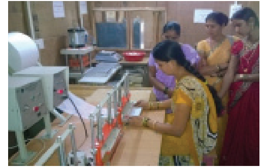
Health empowerment: Set up as part of 5H program, unit at Mohi village in Maharashtra makes sanitary napkins

Women in this village faced several health issues but were not ready to discuss them openly due to lack of knowledge. The couple organised awareness workshops in Mohi, and 70 women participated.