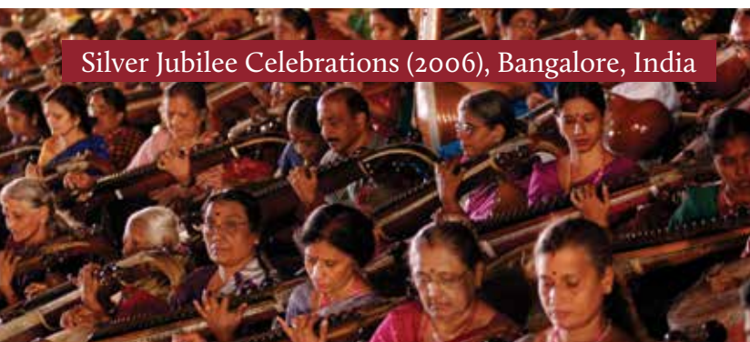
Silver Jubilee Celebrations (2006), Bangalore, India