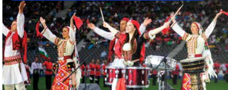
World Culture Festival (2011), Berlin, Germany

Showcasing the rich cultural traditions of dance, music and the arts from around the world as well as Yoga, the Festival hopes to foster a deeper understanding between people of different faiths, nationalities and backgrounds.